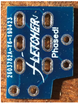
This side Towards the Switch